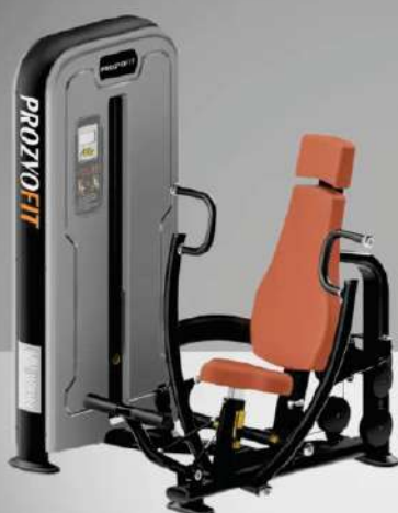
SEATED CHEST PRESS