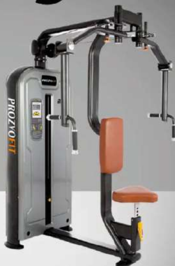
PEC DEC FLY